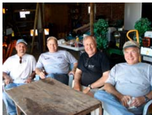
None of these guys has a license to do this - you can bet on it...

This month's Fire Truck Work Day was a great success and thanks to Rum front showing up with some great equipment and two upright pirates. We got incredible things done in a short period of time. Our crew of mechanical pirates